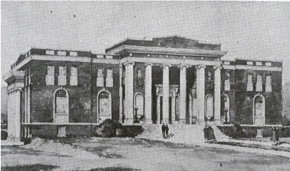
Library Building, 1928

The library at Southeastern Normal School began in 1909 when two librarians were hired, and the faculty of the new school were asked to donate ten books each to the new library. When the permanent building for the school was finished in 1910, the library was housed on the third floor. In 1911, a large shipment of books and materials was sent to the library. In 1915, the library was installed with lights, enabling students to study in the library at night. By 1917 the library had nearly one thousand children's books, something that was not found in any other normal school in the state.